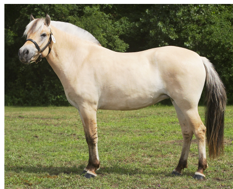
Tarissa - Dam