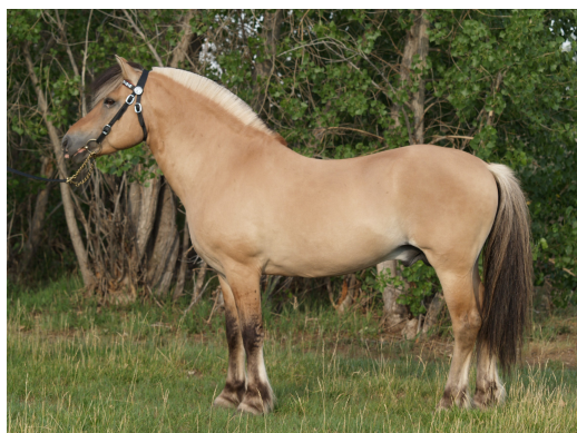
Felix - Sire