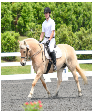
Ironwood MaryAnn 2009 Filly out of Lynnhaven Elli (BDF Malcom Locke x Grete)