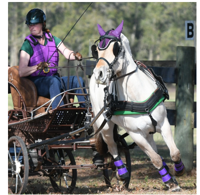
Ironwood Xander 2012 Colt out of FC Madellin (Modellen x Lin)