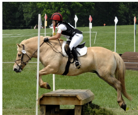
Ironwood Roheryn 2009 Colt out of Lupin (Karibu x Serina)